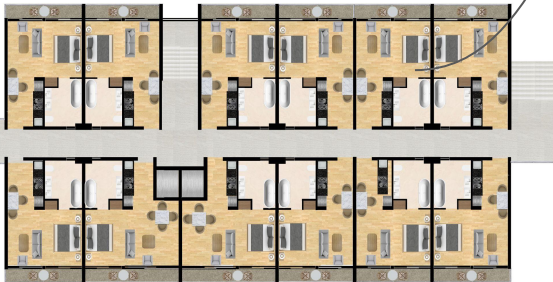
Block - A Floor Plan Layout