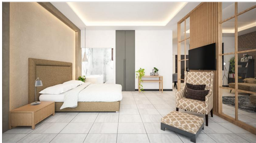
1BHK Bedroom Block-A