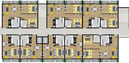
Block - A First Floor Layout 1/10K & 2/10K