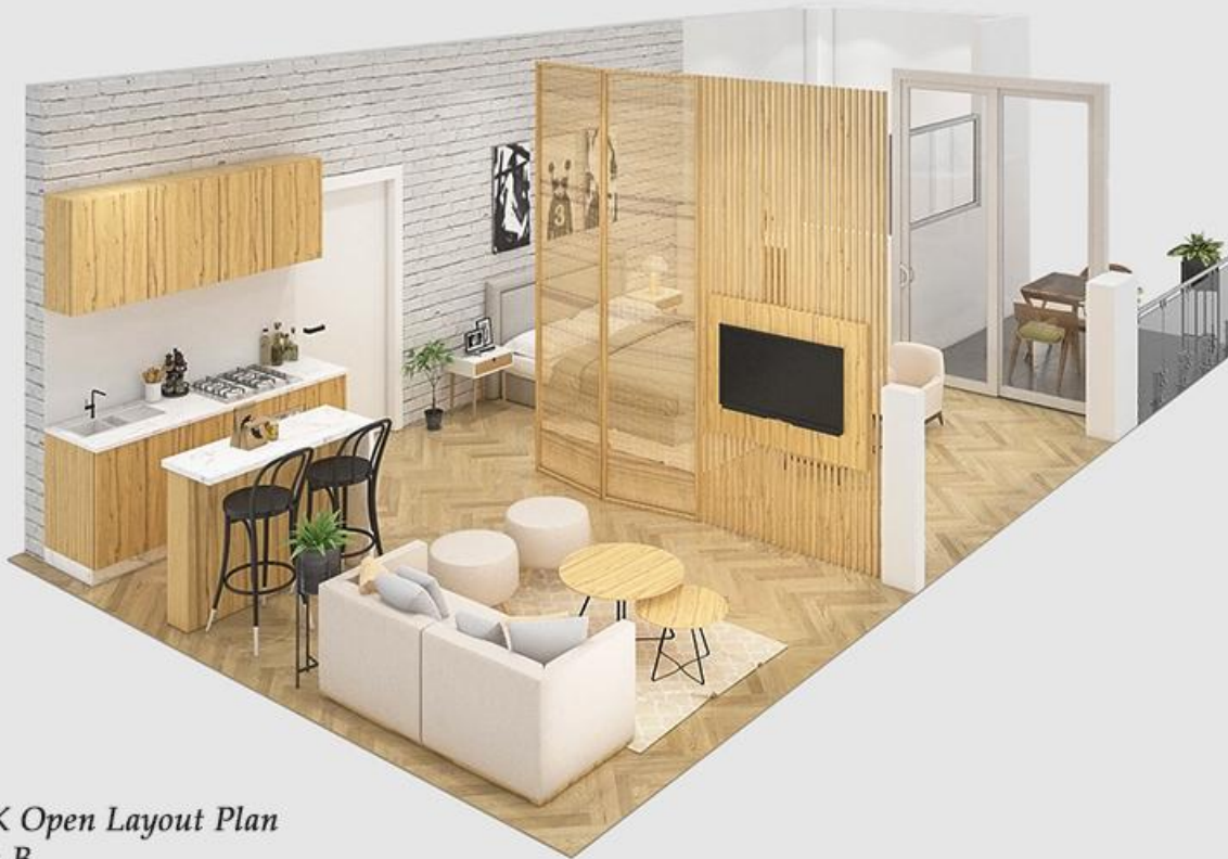
1BHK Open Layout Plan Block-B